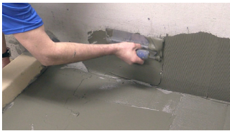
Apply bonding agent