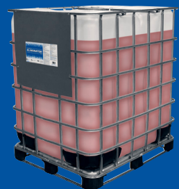
330-gallon tote Part: 49330