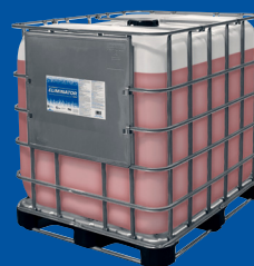
275-gallon tote Part: 49275