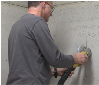
Mark and cut area for Niche