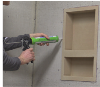
Insert Niche, caulk, and tile

Visit our website for complete in-depth instructions, diagrams, and how-to videos on all Noble products.