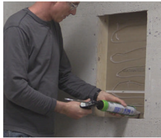
Apply silicone to backing